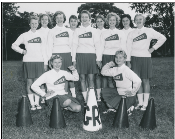
Glen Rock High School cheerleaders, 1958/59

Look for our display at the Glen Rock Public Library in September, featuring materials from this wonderful collection.