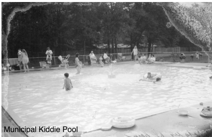
Municipal Kiddie Pool