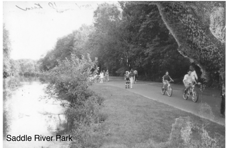
Saddle River Park