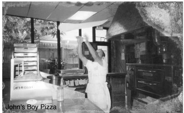
John's Boy Pizza