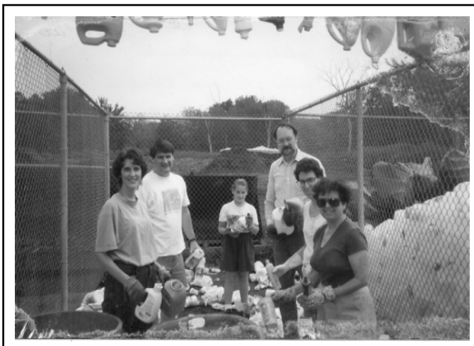
Do you remember having to separate your plastics at the Recycling Center? In this photo, GRHPS members in 1994 are preparing plastic bottles to be baled.